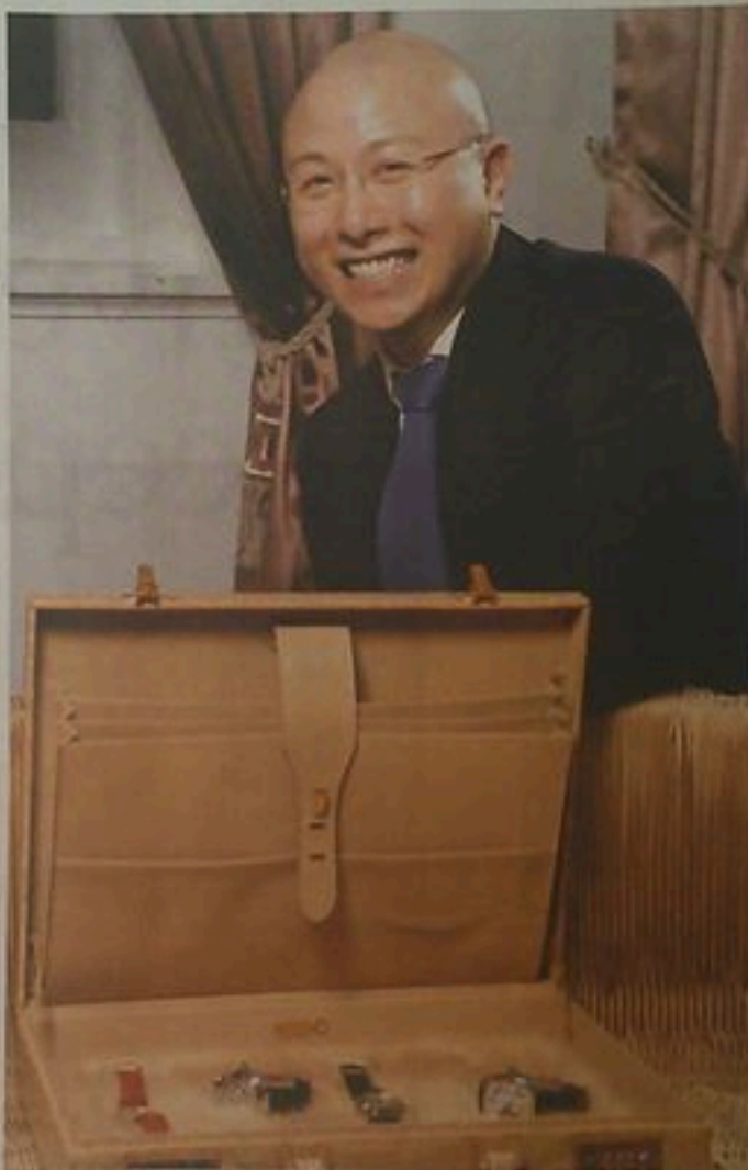
ST PHOTO: DESMOND WEE